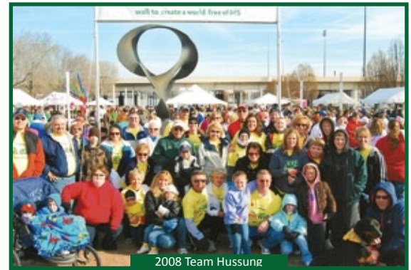
2008 Team Hussung

Spring is around the corner and Team Hussung is gearing up for Walk MS 2009 Louisville. By joining Team Hussung, you will be signing up not just for a day of fun, but also for a celebration of the great things we can achieve when working together for a common cause. Walkers raise funds for the National Multiple Sclerosis Society by collecting pledges and walking approximately three miles on the day of the event. Throughout the route, the Society provides rest stops, great food, support vehicles and medical personnel. Each step we take brings us one step closer to a cure - and closer to a world free of MS. So what are you waiting for? Join Team Hussung today or make a donation on Team Hussung's behalf! You can register one of two ways: go to Walkmsky.org and click on Walk MS Louisville 2009 or you can call 502-657-3859. Team Hussung's fund raising goal for 2009 is $16,000.00! Hussung Mechanical and HMC Service will match funds raised! The deadline to register is approaching, so register today!